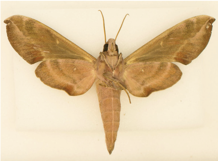
Figure 2. Ventral view of Daphnis placida female from Guam.