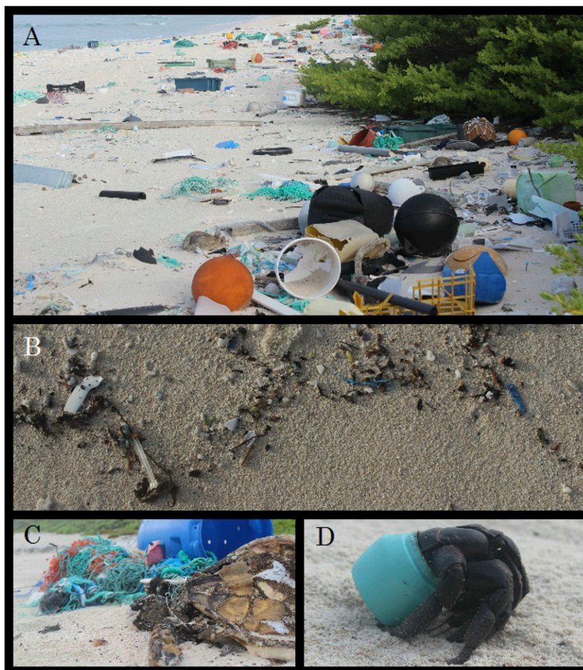
Fig. 3. (A) Plastic debris on East Beach of Henderson Island. Much of this debris originated from fishing-related activities or land-based sources in China, Japan, and Chile (Table S5). (B) Plastic items recorded in a daily accumulation transect along the high tide line of North Beach. (C) Adult female green turtle ( Chelonia mydas ) entangled in fishing line on North Beach. (D) One of many hundreds of purple hermit crabs ( Coenobita spinosa ) that make their homes in plastic containers washed up on North Beach.

Changes in the frequency of wildlife ingestion of or entanglement in debris are often used as an indicator of pollution in the