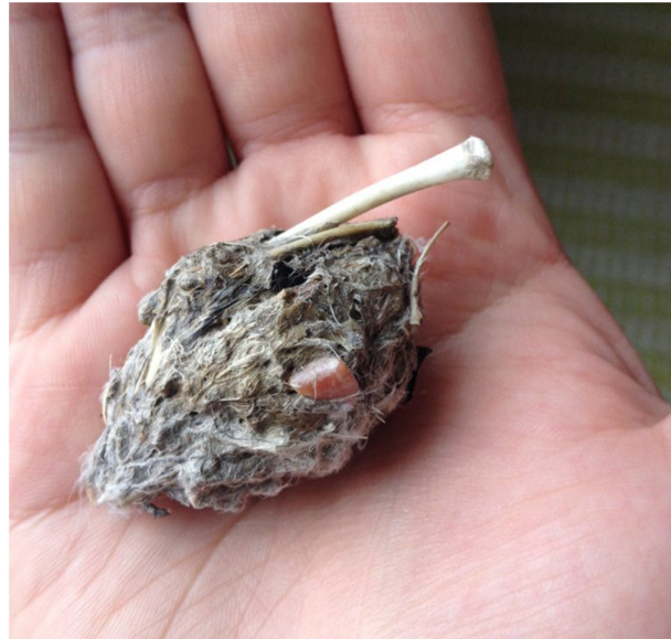
Fig. 3. A regurgitated pellet collected from a great skua ( Stercorarius skua ).

interest (Ryan and Fraser 1988; Votier et al. 2001; Hammer et al. 2016). In contrast to the accumulated plastics found during stomach dissections, pellets, like regurgitations, represent a snapshot of only a short period of time. Most pellet collections are also limited to the breeding season when marine birds are at terrestrial nesting sites, limiting seasonal comparisons in many species.